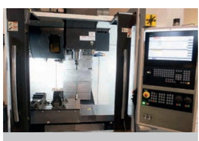
LK-Machinery - Siemens 828