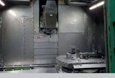
Maho MH1600S- Philips