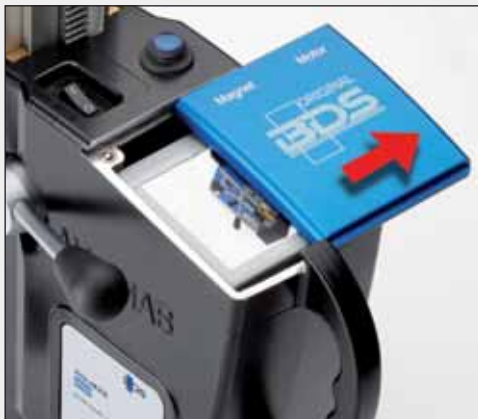
The slider seals and protects the rechargeable battery unit.