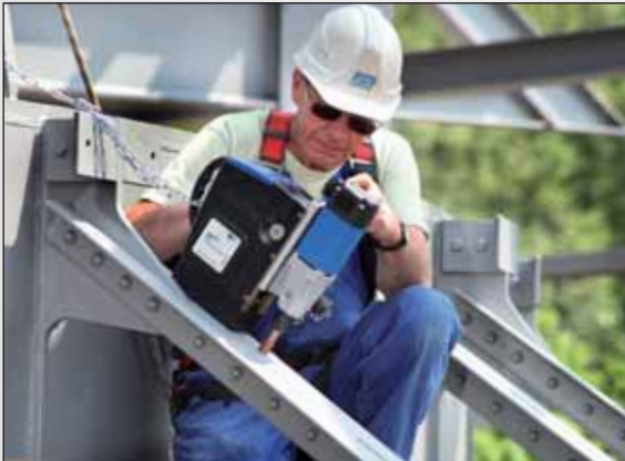
Working outdoors requires independent and flexible solutions.