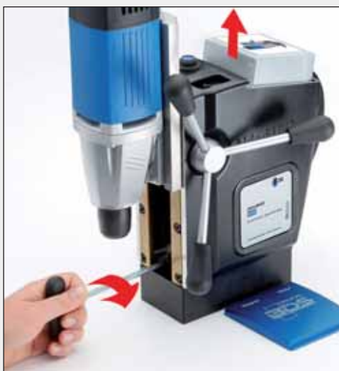
Replacing the rechargeable battery is quick and easy.