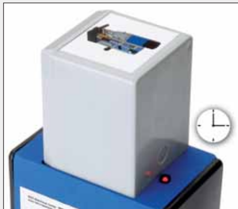
100 % charging capacity already available after 180 minutes