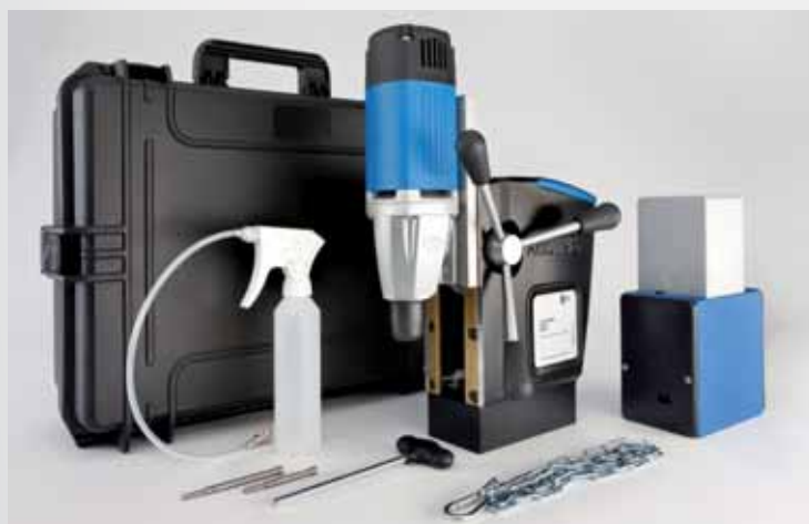
The complete mobile magnetic core drilling system from BDS in a practical case.