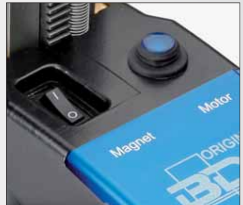
Motor and magnet switch are located centrally and within easy reach.